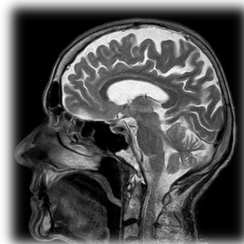
MRI of the brain

Concussions, also known as a mild traumatic brain injury, occur when the head/body sustains a blow or jarring motion causing the brain to move inside the skull. Concussion symptoms can vary widely among individuals and can impact one's ability to return to normal daily life and routines. Some of the most common symptoms include headaches, dizziness, vision changes, memory issues, and difficulty sleeping. It is estimated that there are over 3 million concussions in the US each year. Physical Therapists trained in vestibular rehabilitation can help you in your recovery and get you back to the activities you enjoy.